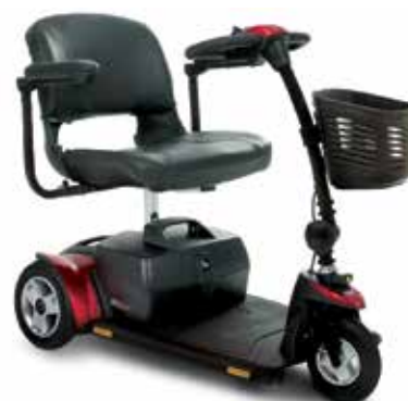
Go-Go Elite Traveller® Plus 3-wheel

PRIDE® MOBILITY SCOOTERS LIVE YOUR BEST®